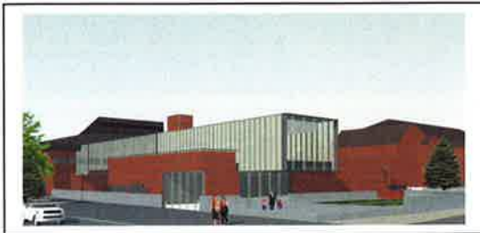
Phase Two Expansion Conceptual Drawing